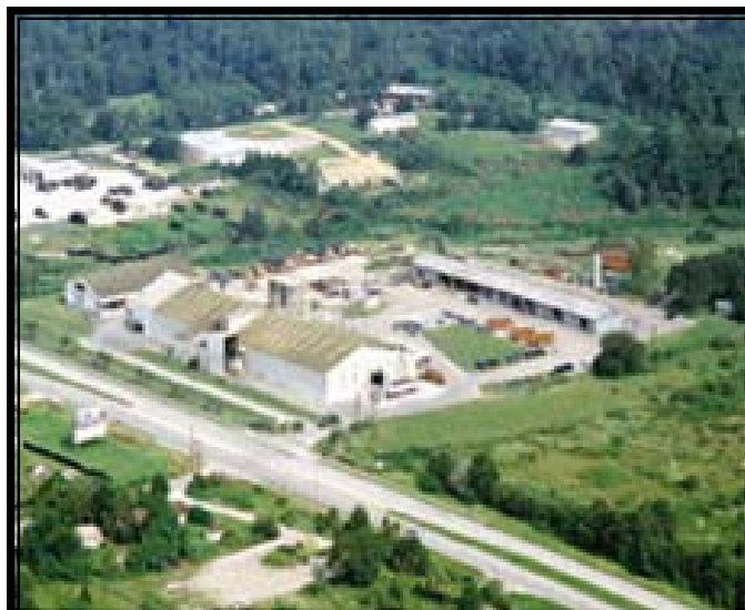
DRY FERTILIZER PLANT Groveland, FL

very complicated and included many points of truck docking and multiple points of product delivery and pickup.